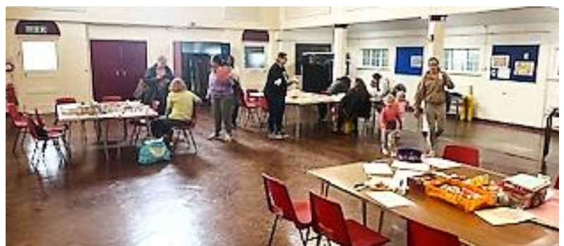
The weather was kind to us