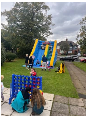
Fun & Games outside and in.