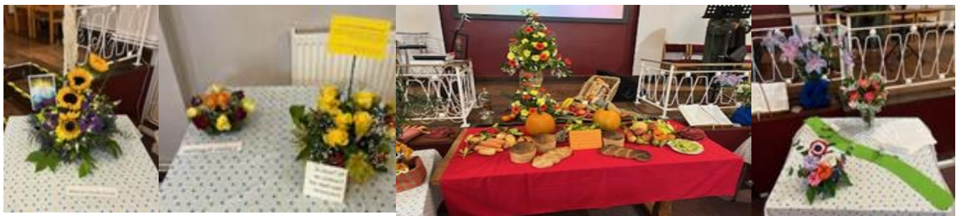
Some of the flower arrangements & harvest display